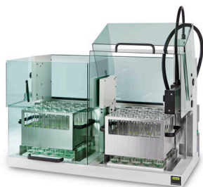
KjelSampler K-377 Auto sampling 48 positions