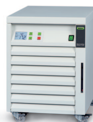
Recirculating Chiller F-108 Sustainable cooling