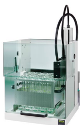
KjelSampler K-376 Auto sampling 24 positions