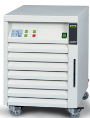
Recirculating Chiller F-108 The efficient way of cooling