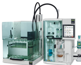
KjelMaster System K-375 / K-376 / K-377 Steam distillation, titration and auto sampling