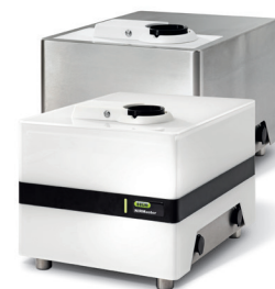
NIRMaster™ IP54 / Pro IP65 FT-NIR spectroscopy