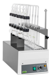
Hydrolysis Unit E-416 / B-411 Safe and fast acid digestion