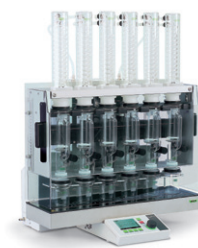
Extraction Unit E-816 Sox/HE Automated Soxhlet extraction