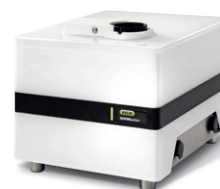
NIRMaster FT-NIR spectroscopy