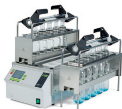
SpeedDigester K-439 / K-425 / K-436 IR digestion