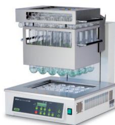
Digest Automat K-438 / K-432 / K-437 Block digestion