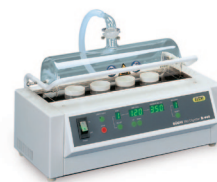
Wet Digester B-440 Incineration