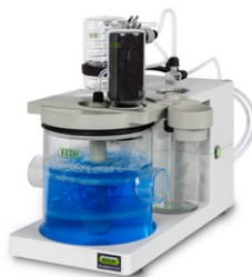
Scrubber K-415 Neutralization