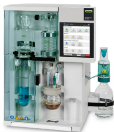
KjellMaster K-375 Steam distillation and titration