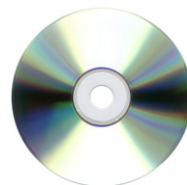
KjellLink PC software Data management