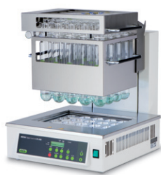
Digest Automat K-438 / K-432 / K-437 Block digestion