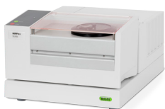
NIRFlex® N-500 Versatile laboratory FT-NIR spectrometer