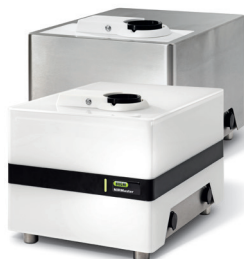
NIRMaster™ IP54 / Pro IP65 FT-NIR spectroscopy