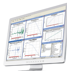
NIRCal® Software Chemometric cali- bration development