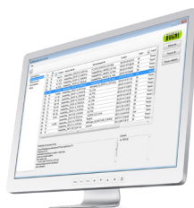
NIRAnywhere Software Network solution