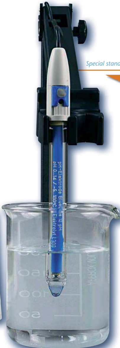
Special stand S4D