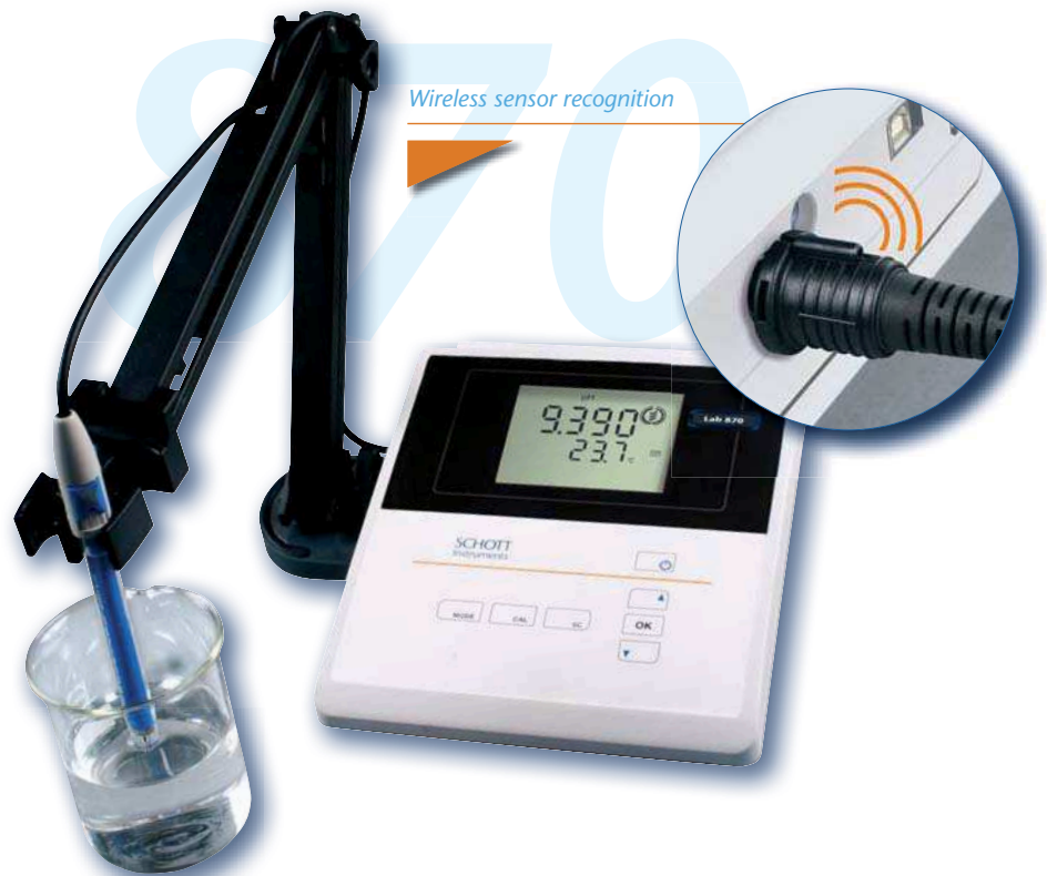
Wireless sensor recognition

The quality controller's dream: A measuring instrument that automatically recognizes the electrode and the user! The new sensors with distinct identification send their specific data to the measuring instrument wirelessly. Wrong measurements are excluded.