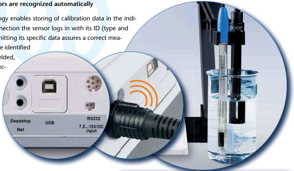
pH combination electrode A 161 ... ID

The latest microtechnology enables storing of calibration data in the individual sensor. Upon connection the sensor logs in with its ID (type and serial no.), and by transmitting its specific data assures a correct measurement. The sensors are identified unmistakably via a shielded, short-range radio connection. No input is needed. Even two sensors side by side can be identified unequivocally.