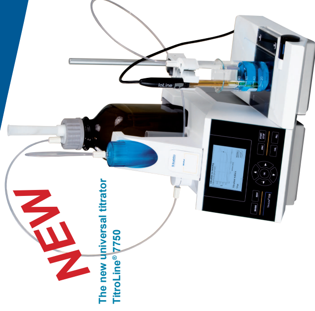
The new universal titrator TitroLine® 7750