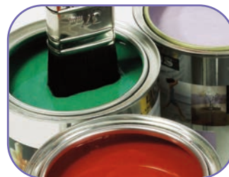
Coatings and Inks