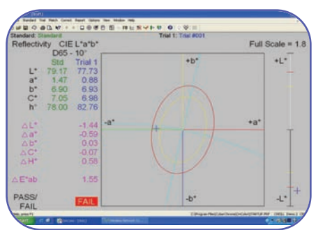
Display Indices and Job ID's