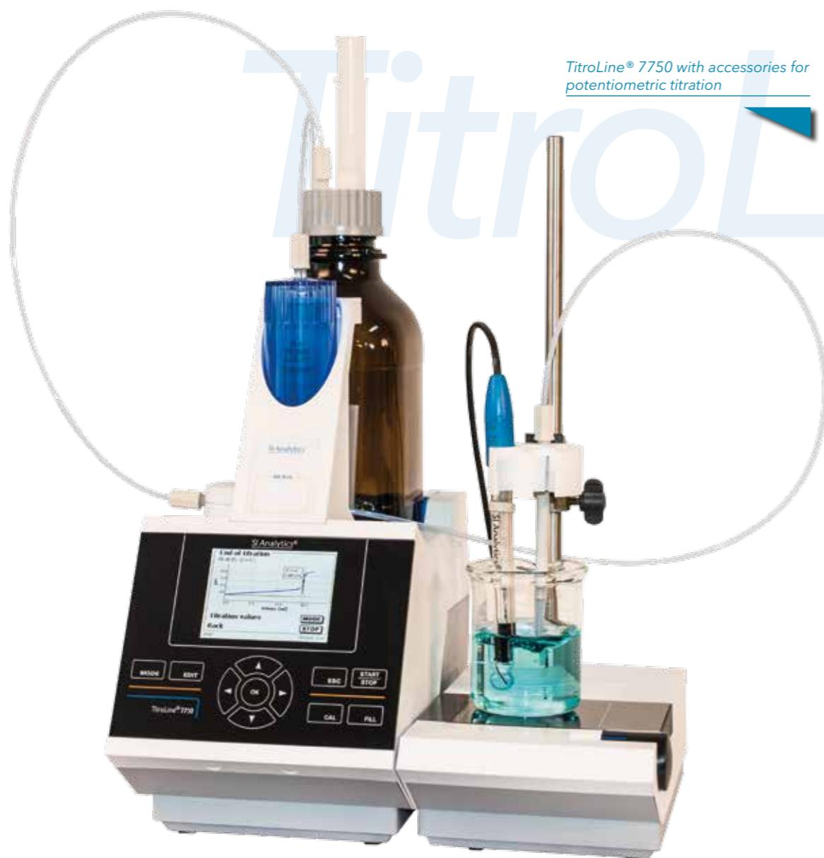
TitroLine® 7750 with accessories for potentiometric titration

The new TitroLine® 7750 is characterized as follows: