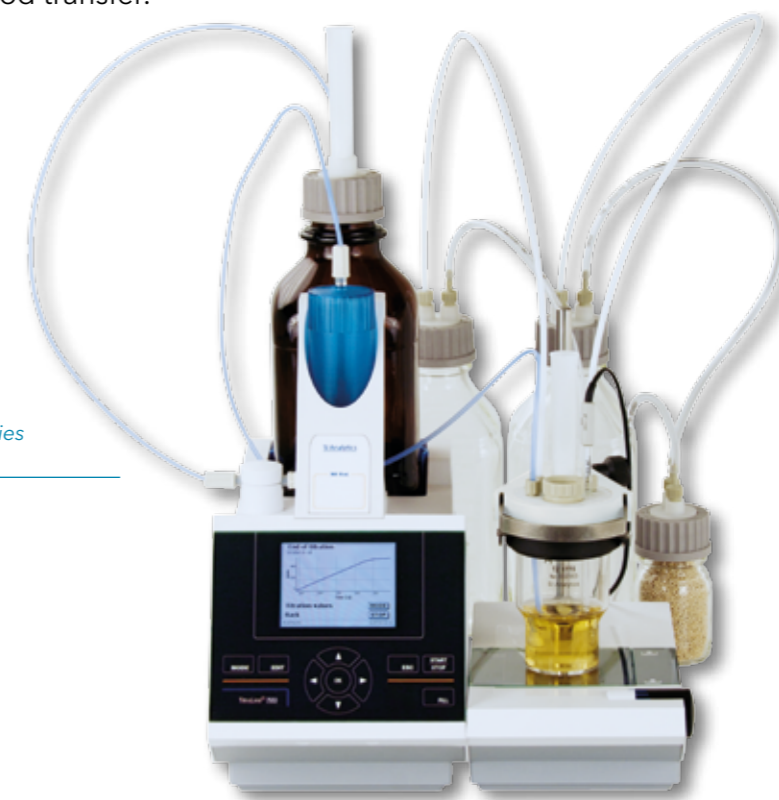
TitroLine® 7750 with accessories for KF titration

→ Please refer to pages 22 and 28 (TitroLine® 7000 and TitroLine® 7500 KF) for more basic details of TitroLine® 7750.