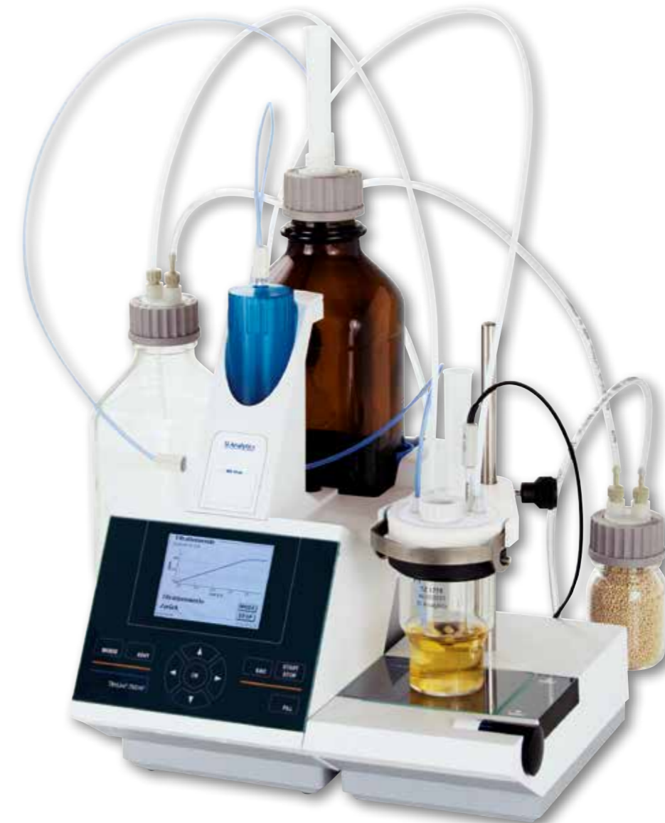
TitroLine® 7500 KF