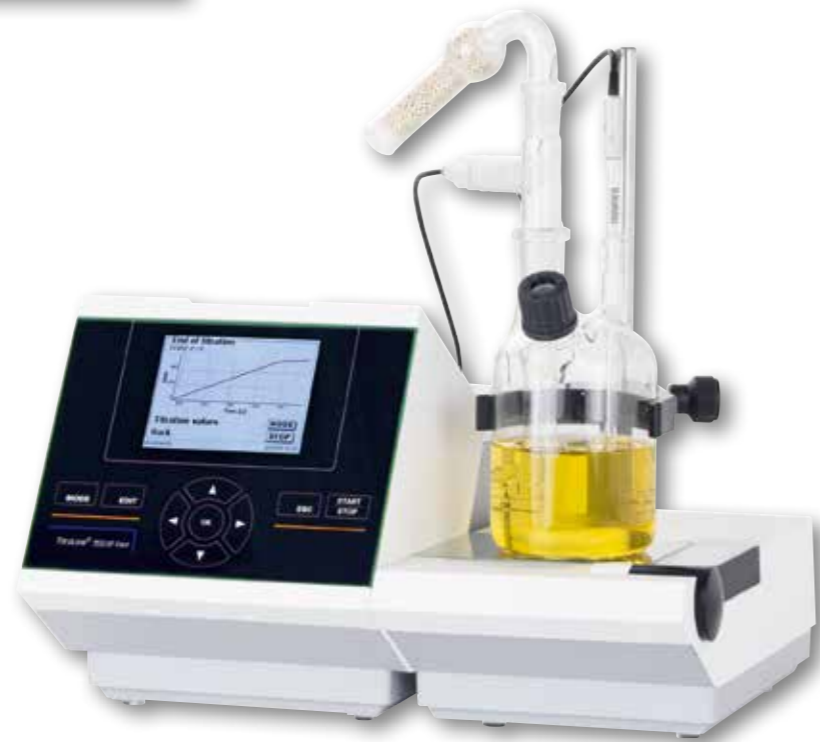
TitroLine® 7500 KF trace