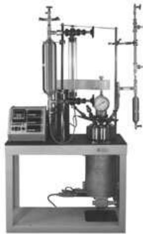
A 2 Gallon Reactor with a Liquid Filling System, Condenser, Receiver and a Bottom Drain