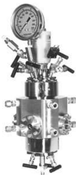
600 mL Stirred Vessel with four Windows, Bottom Split-Ring Closure, and Clamp-on Cooling Block