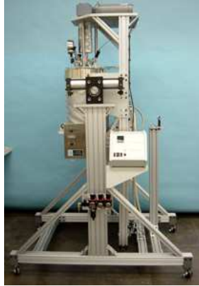
Horizontal Vertical System