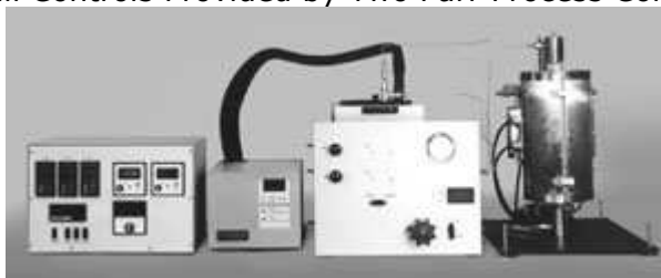
Custom Built Tubular Reactor with Chilled Feed System