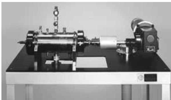
Custom Built Horizontal Stirred Reactor