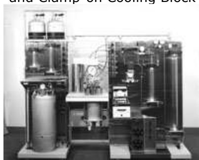
Custom Built Catalyst Preparation System