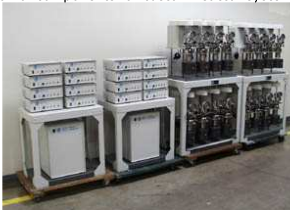
16 Station Reactor System

The Parr Instrument Company Technical Staff is available to assist in the design, selection and integration of components for custom reactor systems.