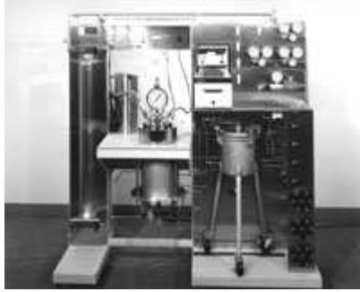
Custom Built Polymerization System