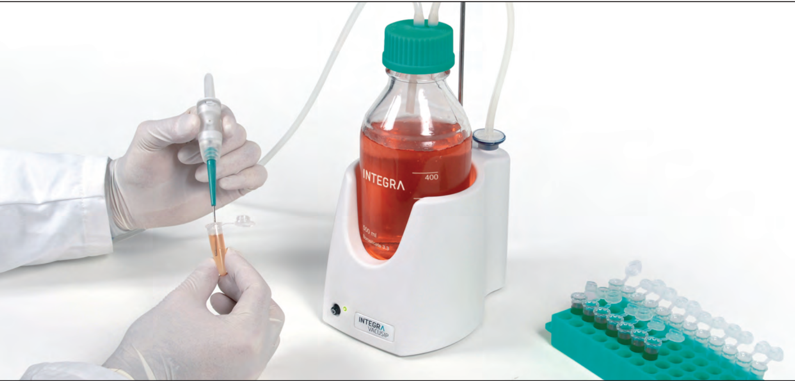
VACUSIP Liquid waste gone in a sip