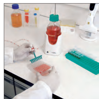
Removal of washing solutions