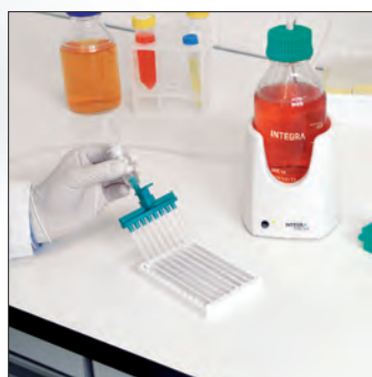
Aspiration from Western blot strips