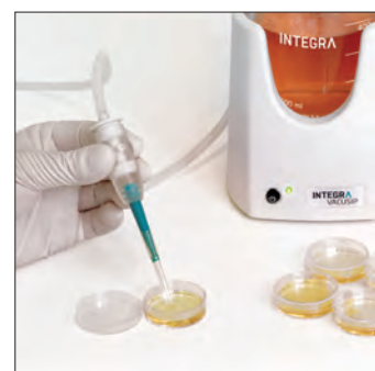
Removal of culture media