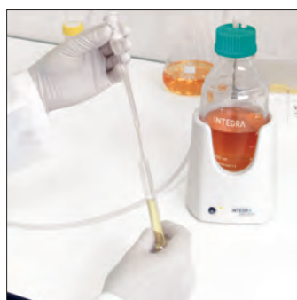
Supernatant removal to harvest bacteria