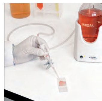
Removal of excess liquid from object slides