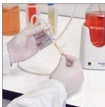
Aspiration of supernatants