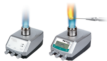
FIREBOY Portable safety Bunsen burner

DOSE IT offers easy handling and straightforward setting of parameters. It is lightweight, fits everywhere in the lab and can be moved easily. The large display and the intuitive user interface make it very easy to set the parameters and operate DOSE IT. Simply choose a dispensing protocol and press run.