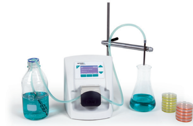
DOSE IT Compact and easy-to-use peristaltic pump

Available in two models, MEDIACLAVE allows the rapid and gentle sterilization of up to 10 or 30 liters of culture medium. Offering precise controlling and monitoring of temperature and pressure during sterilization, MEDIACLAVE guarantees media of reproducible high quality. Intuitive multilingual user interface and simple programming make it very easy to operate.