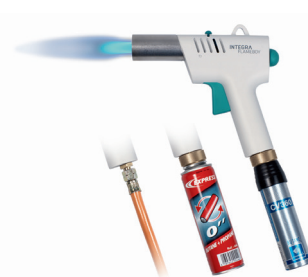
FLAMEBOY Portable flame sterilizer

The unique TUBEFILLER option is the perfect extension to the functionality of MEDIAJET, enabling conversion from a Petri dish filler into a test tube filler in just a minute. It is designed for the continuous filling of various test tube sizes and is suitable for a wide range of dosing applications, including the production of agar slants, broth cultures or NaCl dilutions.