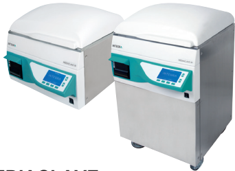
MEDIACLAVE Fast and reproducible media preparation

Available in two models, MEDIACLAVE allows the rapid and gentle sterilization of up to 10 or 30 liters of culture medium. Offering precise controlling and monitoring of temperature and pressure during sterilization, MEDIACLAVE guarantees media of reproducible high quality. Intuitive multilingual user interface and simple programming make it very easy to operate.