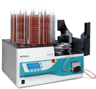
MEDIAJET Reliable walk-away media dispensing system

FIREBOY ensures the highest application safety by providing continuous flame monitoring and overtemperature protection. Electrical ignition is triggered via button or footswitch. In addition, FIREBOY plus has a graphical user interface for convenient operation including setting of a defined maximum burning time. Ignition triggered by an optical sensor allows hands-free operation.