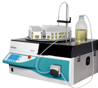
MEDIAJET TUBEFILLER Two applications in one system

MEDIAJET media filling system offers the unique flexibility to fill Petri dishes, Petri dishes with two compartments (Bi-Plates) as well as test tubes of various sizes. MEDIAJET is the perfect complement to MEDIACLAVE as it allows the continuous filling of up to thirty liters of culture medium into Petri dishes.