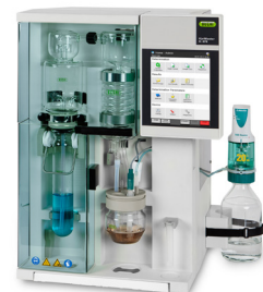
KjellMaster K-375 Steam distillation and titration