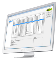
NIRAnywhere Software Network solution