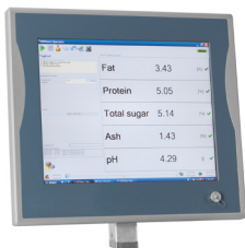
Monitor IP65 Waterproof touch-screen